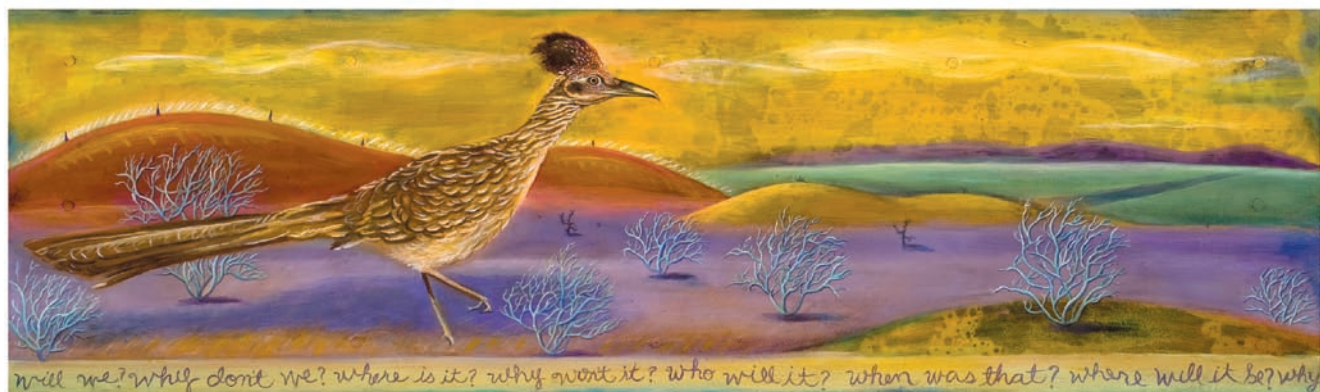
el mirage / 24" x 32", oil on metal retablo