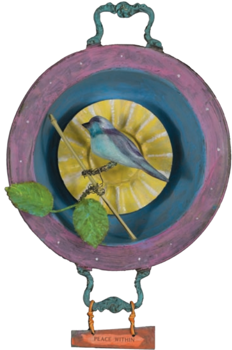
peace within / mixed media altar with sculpted bird. The artist used a silver sugar bowl found in a thrift shop.