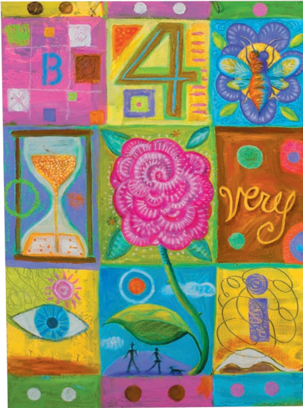
B 4 hour very eyes 24" x 28", oil on section of old metal sign