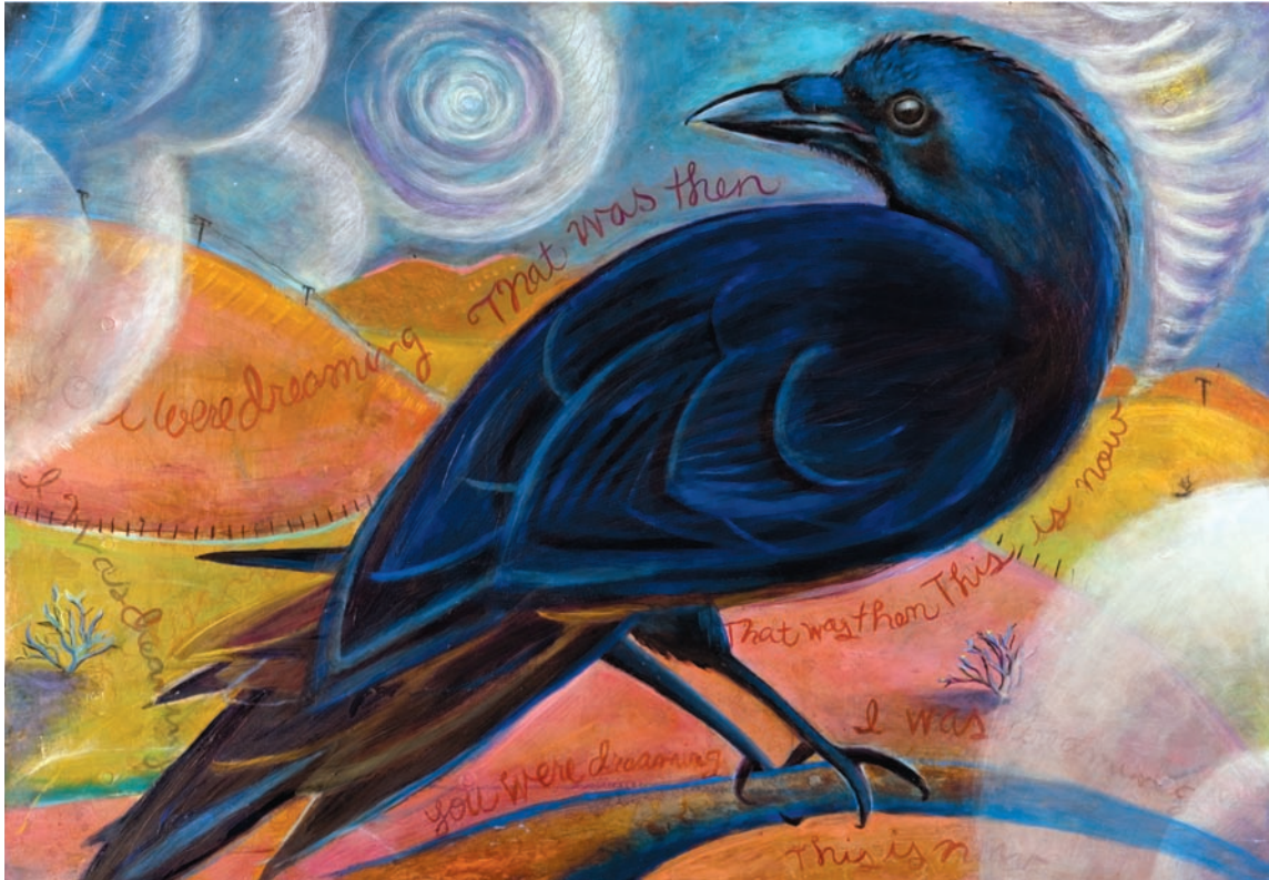
then and now / 40" x 28", oil on metal retablo