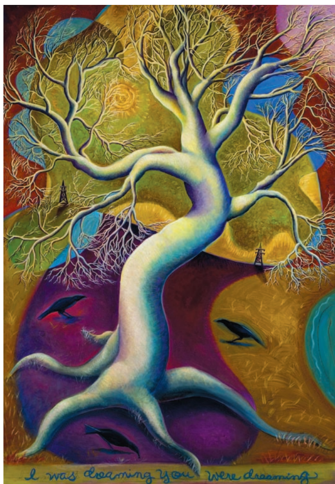
I was dreaming you were dreaming 28" x 40", oil on metal retablo