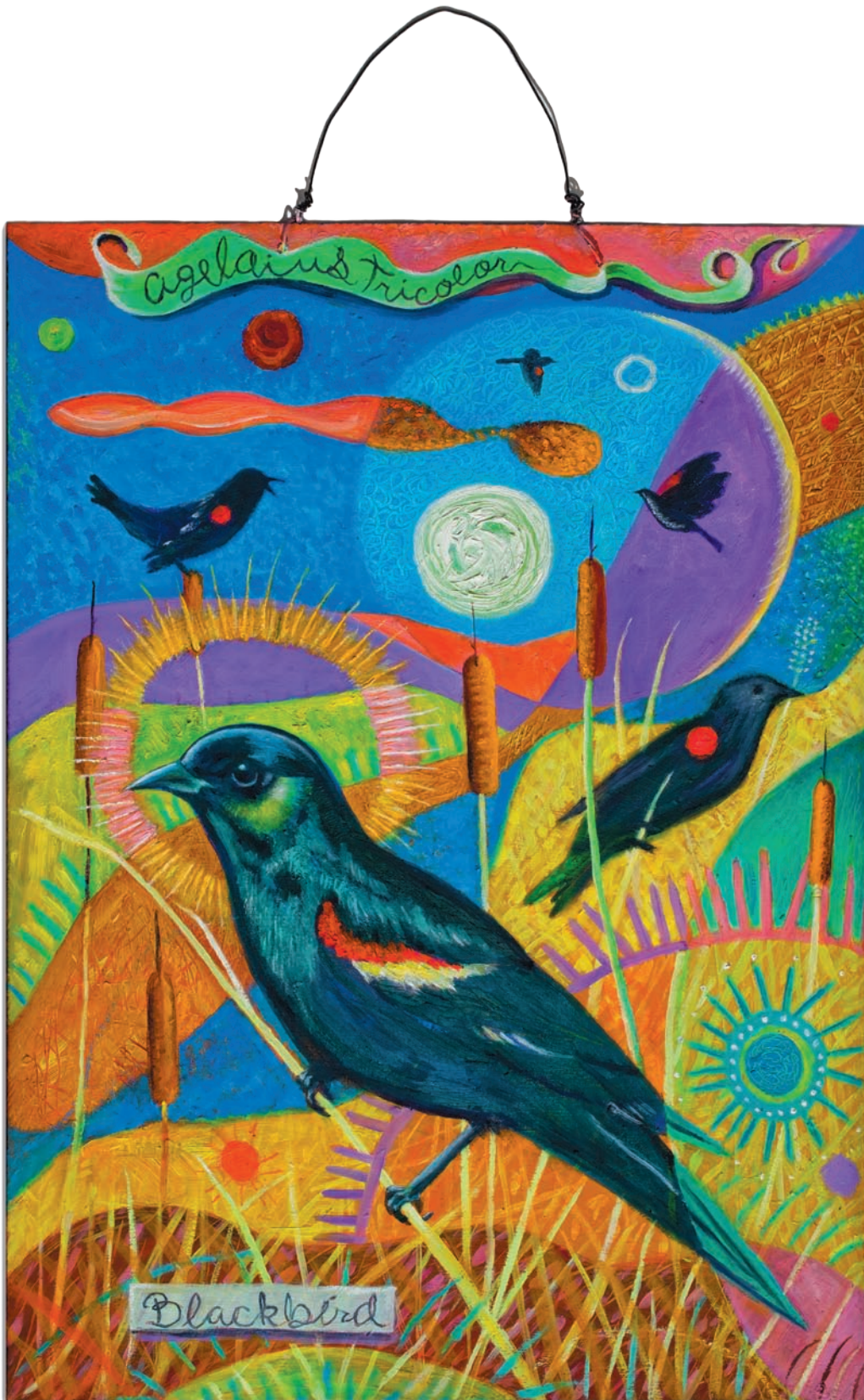
blackbird / 24" x 28", oil on section of old metal sign