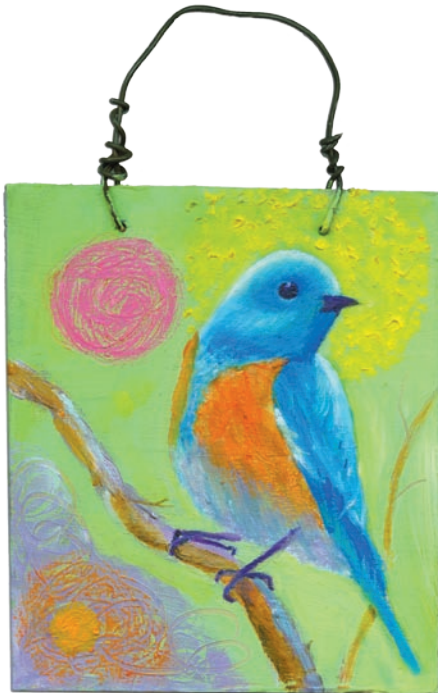
bluebird of happiness 3" x 4", oil on salvaged metal